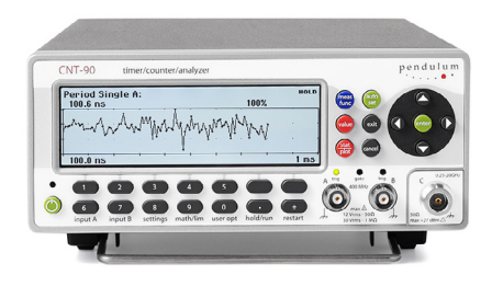
Figure 5: Display showing the trend (signal over time) of sampled data.