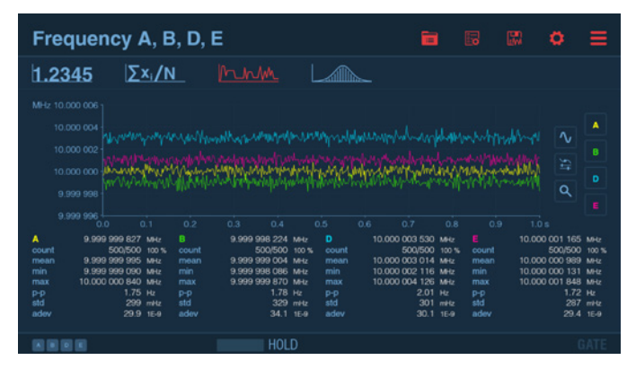
View 4 signals simultaneously on screen. 4 instruments in one!

Measured values are presented as both numerics and graphics. The graphical presentation of results (distribution, trends etc.) gives a better understanding of the nature of jitter. It also provides you with a much better view of changes vs time, from slow drift to fast modulation. The same data set can be viewed in Numerical, Statistics, Distribution and Time-line views. It is very easy to capture and toggle between views of the same data set.